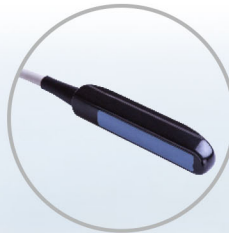
Intrarectal linear probe 4.5-H9.0MHz: 6I7C