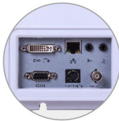
Various I/O ports