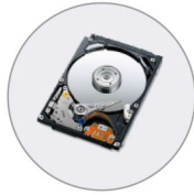
Built in workstation