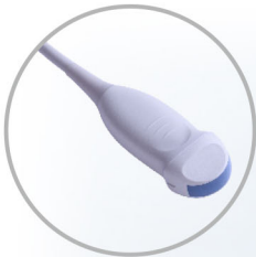
Micro convex probe 5.0-H9.0MHz: 6C15C 2.5-H6MHz: 3C20C