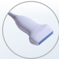
Linear probe 6.5-H10.0MHz: 7L4C 5.0-H11.0MHz: 8L4C 8.5-H14.5MHz: 10L25C