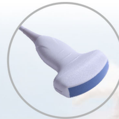
Convex probe 2.5-H6.0MHz: 3C6C